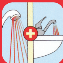
SHOWER + SINK