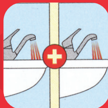
SINK + SINK